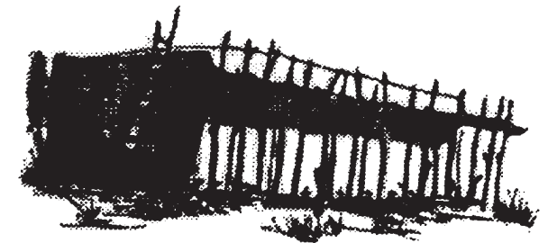
El Cuartelejo Indian Pueblo

Lake Scott SP & WA 101 W Scott Lake Dr. Scott City, KS 67871