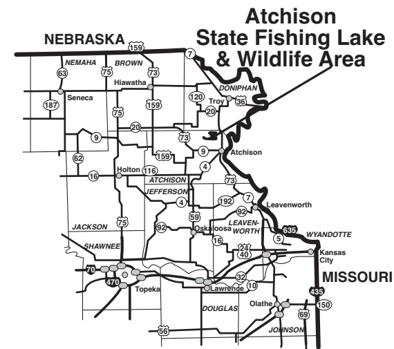
General Area Map

Equal opportunity to benefit from programs described herein is available to all persons without regard to race, color, gender, sexual orientation, gender identity or expression, religion, national origin, ancestry, age, military or veteran status, disability status, marital or family status, genetic information or political affiliation. Concerns of discrimination should be sent to KDWP, 1020 S Kansas Ave., Topeka, KS 66612. 11/24